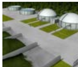
Landfill & Biogas