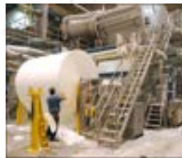
Paper & Pulp