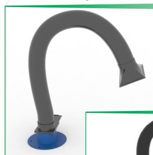
Arm With Adapter